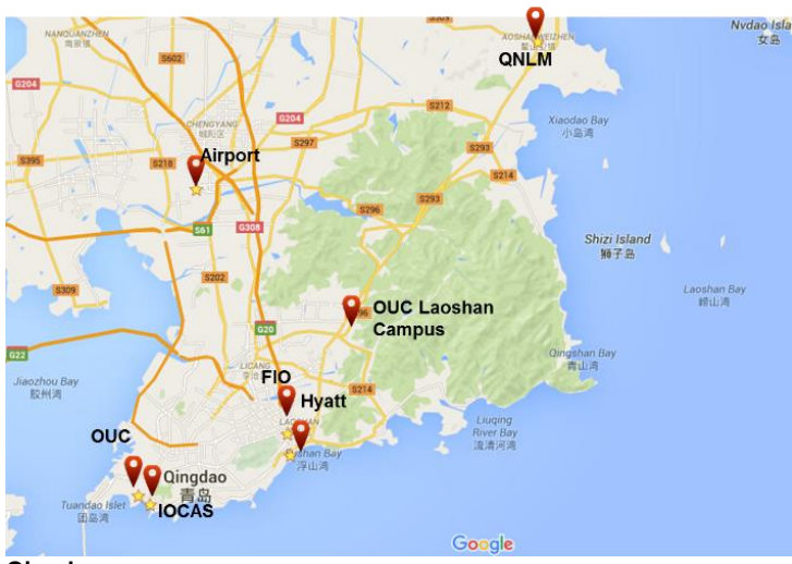
Qingdao area map

Regional Stakeholder Forum 18 September: Hyatt Regency Qingdao