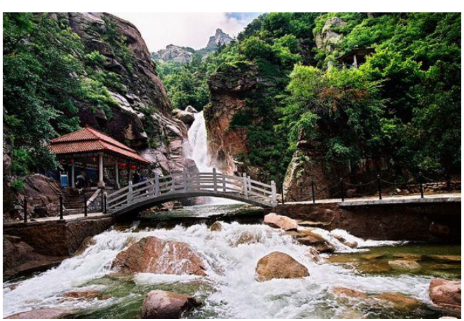
Laoshan Mountain Park

If you require an invitation letter for visa purposes, you must register before 31 July . After this deadline, the Local Organising Committee cannot guarantee that a letter will be issued in time for you to obtain your visa to travel to China.