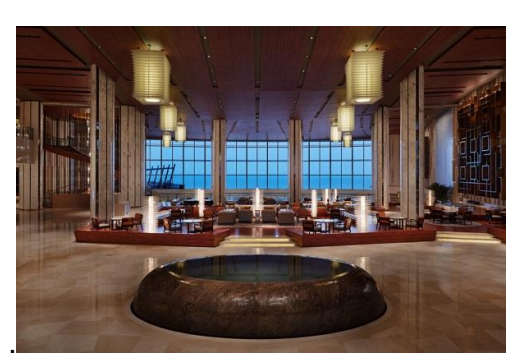
Hyatt Regency Lobby

In the evening of Tuesday and Wednesday there will be opportunities to hold town hall meetings to discuss new research directions and projects. More information will be made available on the conference website: <a href="https://www.clivar2016.org">www.clivar2016.org</a>.