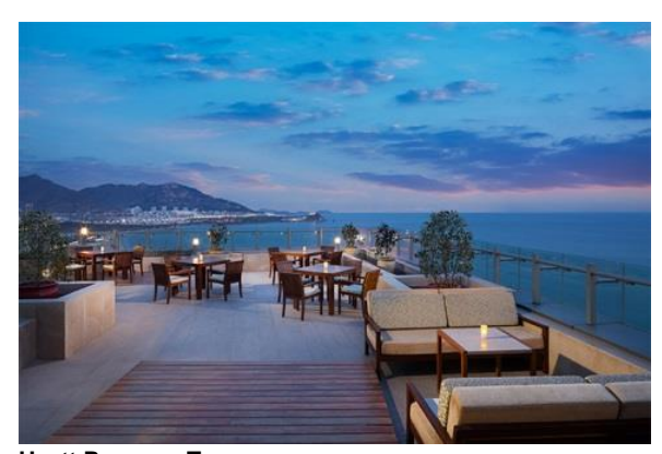
Hyatt Regency Terrace